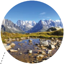
Chamonix/Mont Blanc 1h30