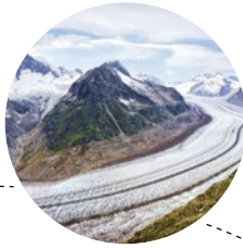
Glacier d'Aletsch 1h45