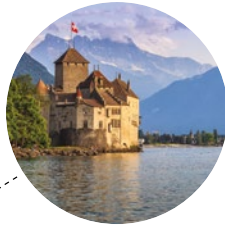
Château de Chillon 1h